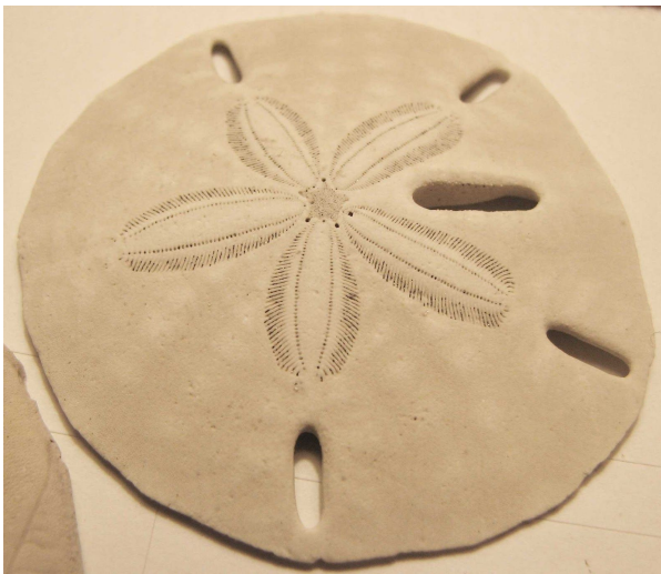
A Full Sand Dollar

Now this is my number 1 thing to collect/find at the beach it is called Sea Glass . Normally you can find Sea Glass in the part of the sand that is still in small pebbles and small rock form. Sea Glass comes in these 5 colors, green (common), white and brown/orange (fairly common), Blue (rare), and finally purple/indigo (really rare). Sea Glass is made of glass bottles(beer bottles) that are left that people throw in the ocean and get pushed and tossed then turns out as transparent(not translucent) with a pretty final color.( Sea Glass is small so you need to really look for them.)