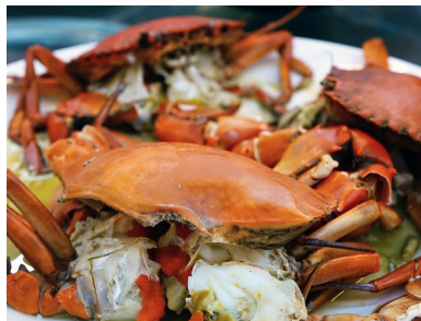
Dungeness Crab Cooked