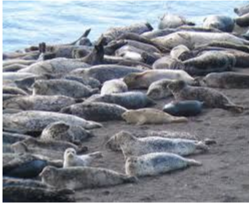
Seals laying on the beach called Goat Rock