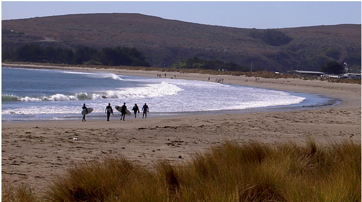
Picture of Doran Beach

One important thing to know about Doran Beach is that it is a very calm beach for kids. It is one of the most popular beach to go to. The water is pretty shallow so you can't really go surfing. But kids can go play in the water more. You might have notice that there are tents and RVs at the beach on the other side of the road. That is because you can go camping there and just walk across the road to the beach. Something that might surprise you is that you can grill on the beach! Usually at the beaches in Bodega Bay do not allow grilling on the beach but Doran does. Actually you don't have to bring a grill they many there. So the next time or when you go to Bodega Bay go to Doran Beach. (Bring some cash because you have to pay to get in)