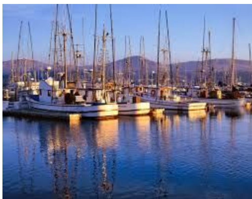
Bodega Harbor in the late afternoon