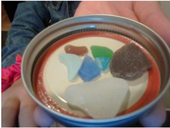
Sea Glass that I found.