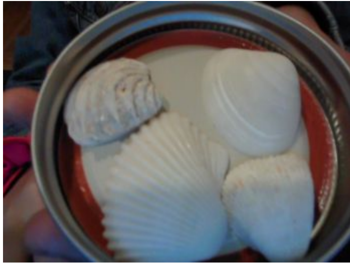
Shells that I found