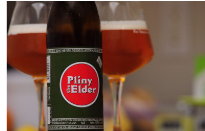
Local beer you can find