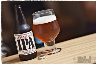
Local Beer you can get at local bar

location of the winery, but if you're going to a local bar for local beer on tap it takes about 5-30. Though if you want to be out in the fresh air closer to the valleys for wine tasting it would be more calm and settle. On the other hand if you want to hear some local music while drinking, then going to a local bar would be good on the music because there is live music.