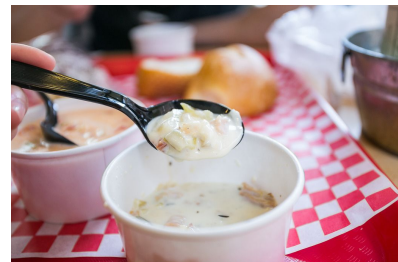
Fresh Clam Chowder