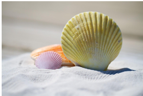
Sea shells you can Find