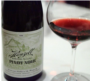
Local wine you can get at local winery