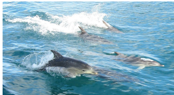
Bottlenose Dolphins swimming through Bodega Bay.