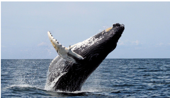
A Blue Whale in Bodega Bay.

Something you can do if you have kids is go Whale watching (watching Whales swim and play with their young in the ocean) and Dolphin watching . Whale and Dolphin watching are very similar. You are both watching mammals and their young swim throw the sea water. But there are some differences. First of all, the whales that migrate throw Bodega bay is the Grey Whale and the Blue Whale. The season for Whale watching is the springtime. (March through the end of June) But for Dolphins there is only one type of Dolphin, the Bottlenose Dolphin. The Bottlenose swims throughout the who year, scientist are still trying to figure out we they don't have a exact migrating time. So, if you're lucky you might see them.