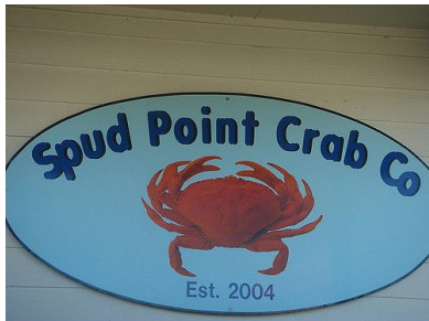
Spud Point logo

Here are some of my favorite restaurants to go to. One of my favorite restaurants to go to is Spud Point. Spud Point has Crab, Soups, and most famous Clam Chowder. They are located in the area of Bodega Harbor. And next door to Spud Point is another of my favorite restaurants called Fisherman's Cove. It is a very nice restaurant along with a shop for fishing. They serve Soups, Grilled Cheese(for kids), Fish Tacos, and Fish and Chips. It is also located in the Bodega Harbor area. The last restaurant I want to recommend you to go to is The Birds Cafe. The Birds Cafe is named after the movie The Birds was made.(learn more on Fun Facts chapter) The Birds Cafe serves Corn Dogs, Chicken Tenders, Fish and Chips, Clam Chowder, and much more. The Birds Cafe is located off of Highway 1. Make sure to check out 1 or all of these restaurants.