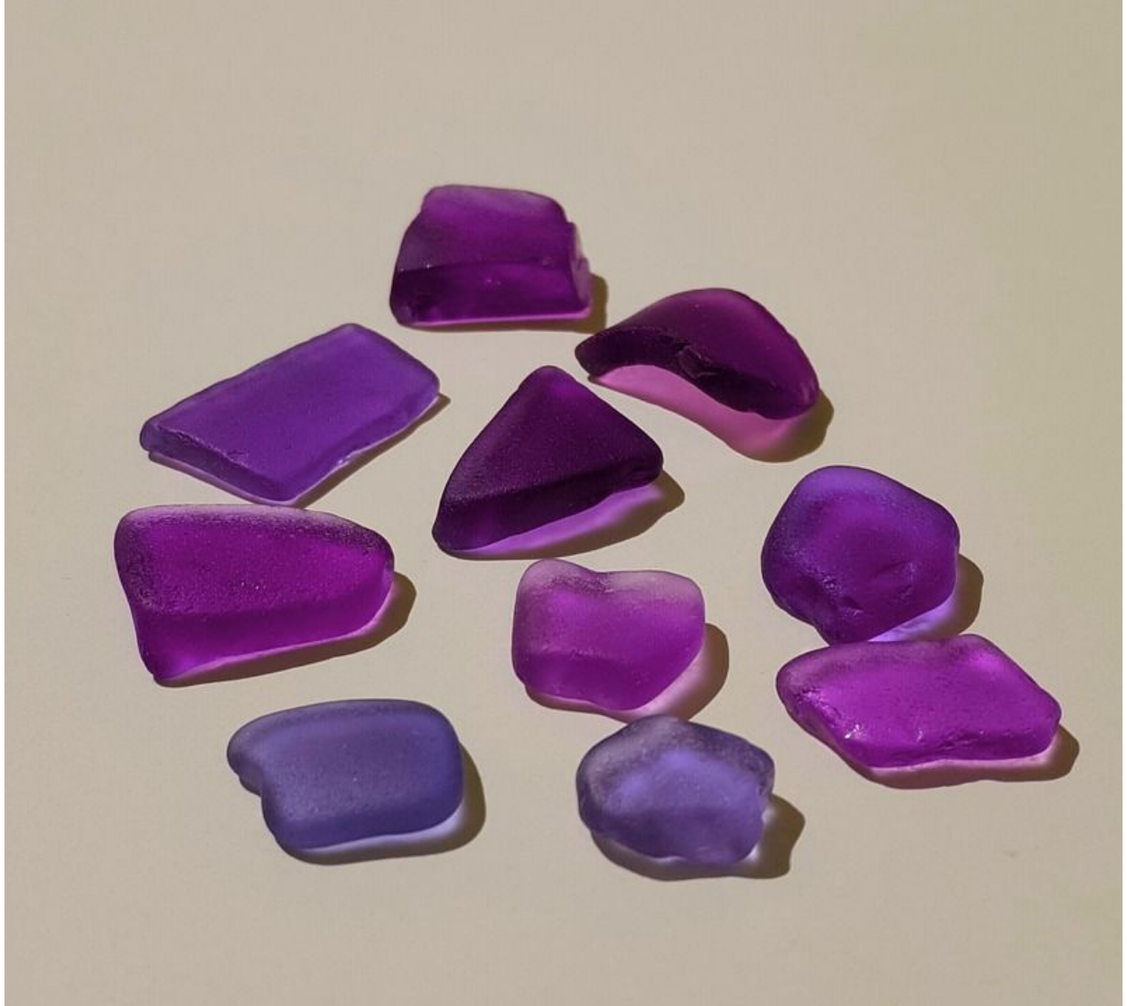
Purple Sea Glass (learn more in Beaches chapter)

Bodega Bay is located on the Northern Coast of California . Just as it shows in the picture above on the previous page. Bodega Bay is above San Francisco but almost next to Santa Rosa. Bodega Bay is part of the Sonoma coast and is part of the wine country.