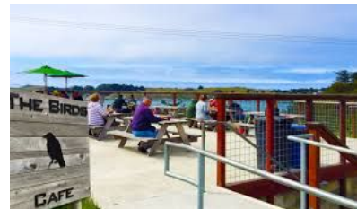
The Birds Cafe