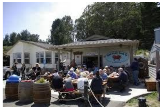
Spud Point crowded with a lot of people